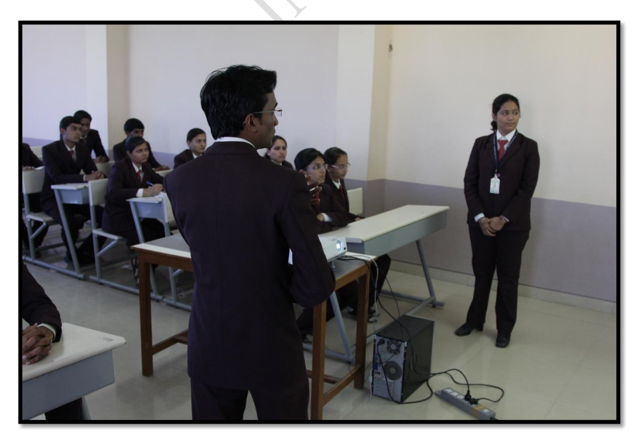
Use of ICT Tools by Students while giving Seminar