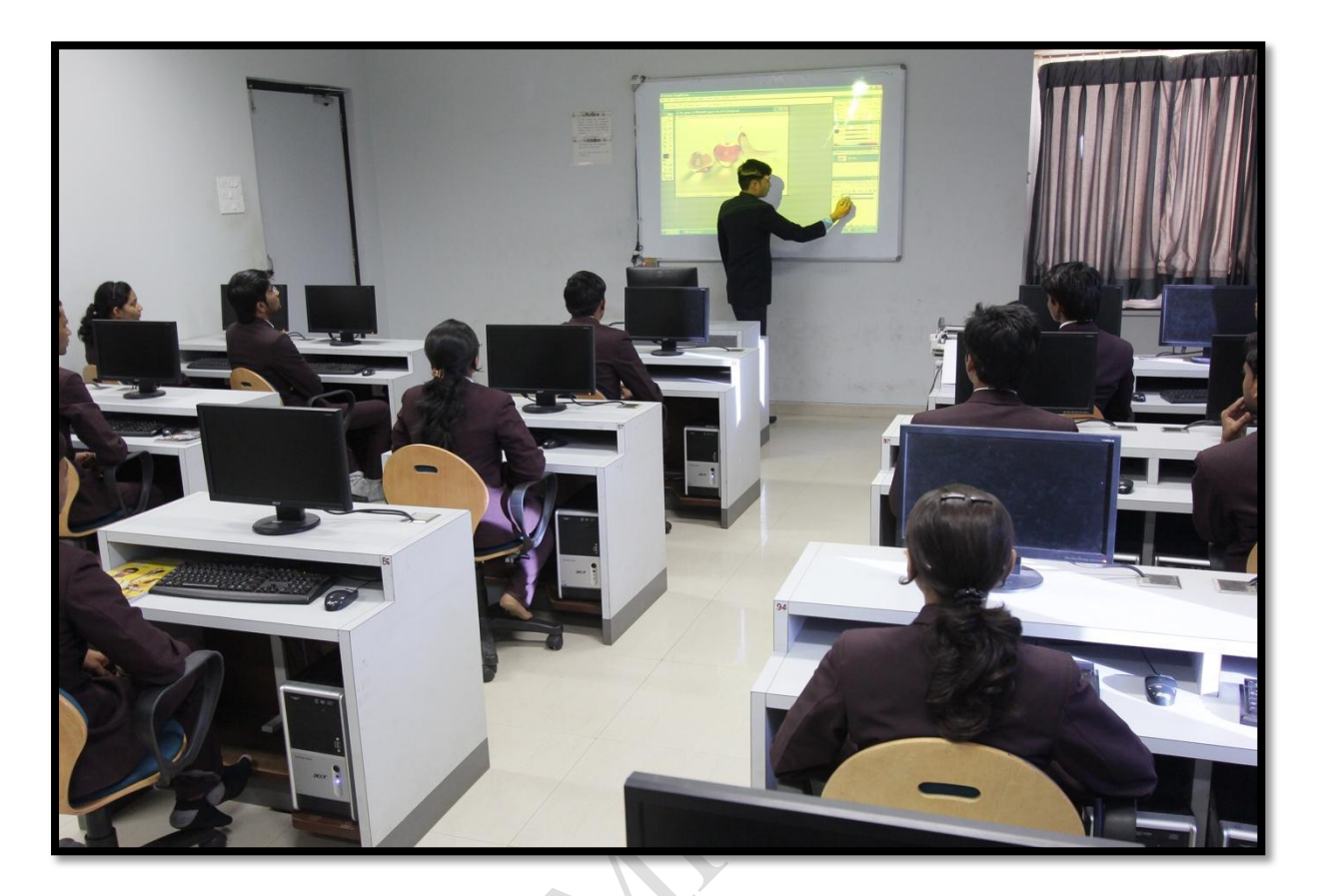
Use of E- Resources by Students in a LAB