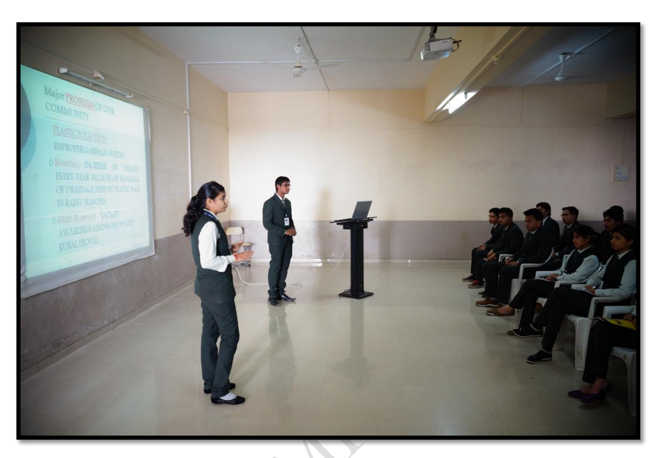
Students giving presentation with the use of ICT Tools